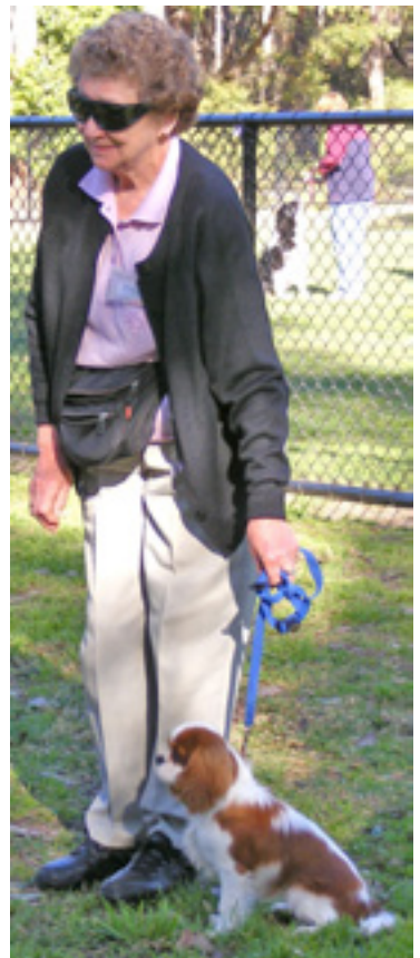
is hard work!