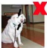
Mouth closed, intense, warning expression