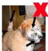
Mouth closed, tail up, intense expression.