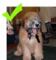
Relaxed, happy dog.