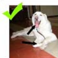
Relaxed, paw tucked.

Learn to speak dog and teach your kids Pet only happy dogs; ask permission