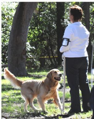
Return to handler & sit