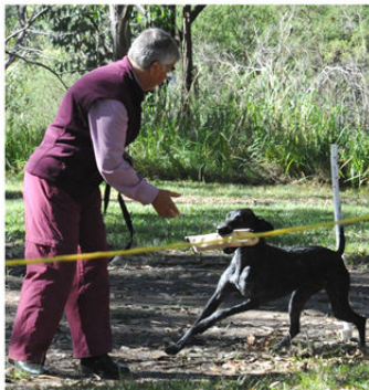
Return to handler with dummy