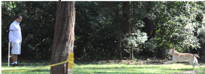
A long recall after a 1 minute sit stay