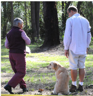
A heeling pattern

Held in conjunction with our Obedience Trial