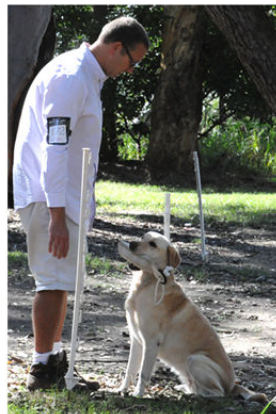
Sit & give