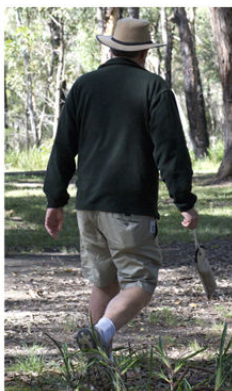
Dummy is thrown