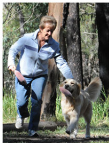
Whoa!! Stop!! It's not a game!