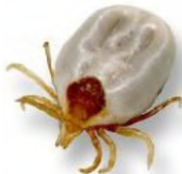
Adult female - Moderate engorgement