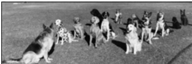
An interesting way of supervising a group 'stay' exercise