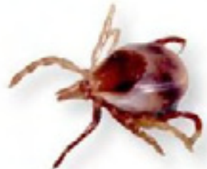
Adult female - Early engorgement

Compressing the body of the tick could cause more noxious substances such as allergens, salivary toxins & infectious micro-organisms to be injected into the host