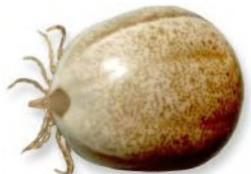
Adult female - Full engorgement