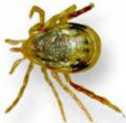
Adult female - No engorgement

The ONLY way to guarantee your dog does not have any ticks on them is to carefully feel all over them EVERY day.