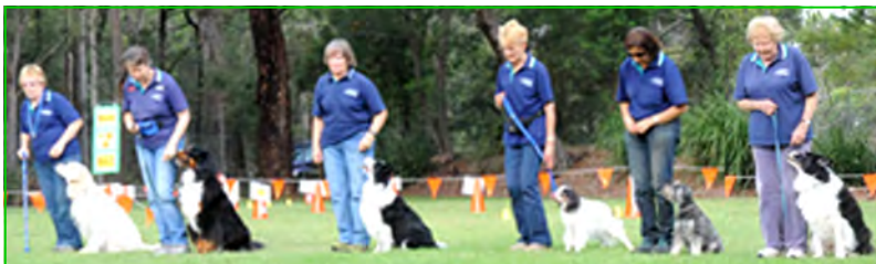
Marching to Music