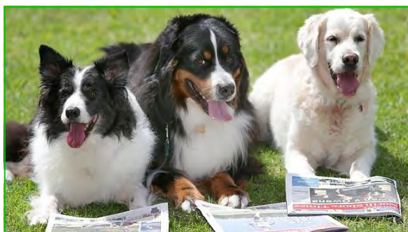
Bonny, Tilly & Fernie 'reading' The Times